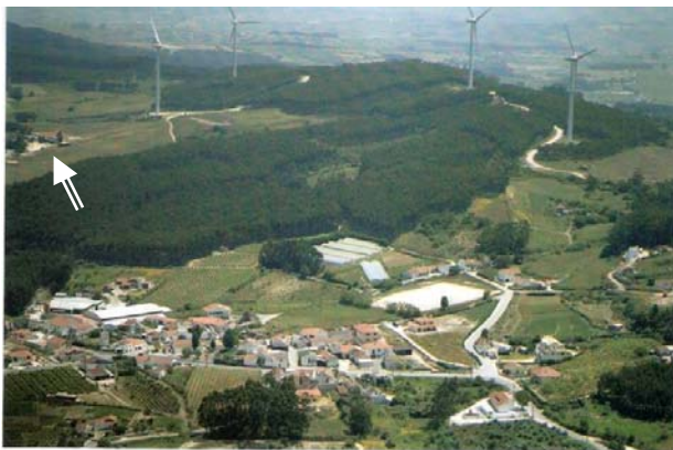
Figure 3. Farm of Family R. isolated on upper left (arrow) with the four wind turbines.

The second case is more recent. Family R. lives on a horse- and bull-breeding farm, located in a zoned, rural agricultural area, 1 hour north of Lisbon. Family R. consists of mother, father, 12-year-old son, and 8-year-old daughter. In November 2006, 4 wind turbines (2MW each) were installed around Family R.'s farm, at approximately 322m, 540m, 580m and 643m from the residential home. The distance to the stables is less than to the residential house (See Fig. 3).