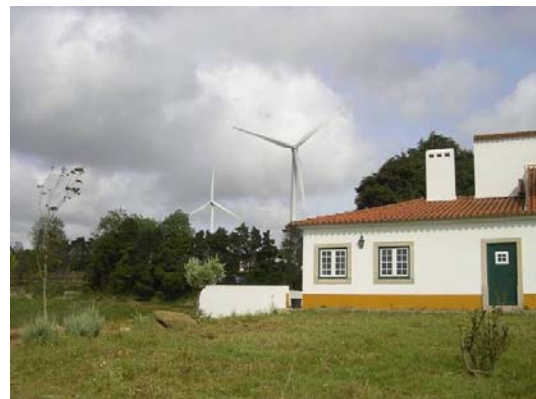
Figure 4. Farm of Family R., with the two of the turbines at approximately 322m and 643m from the home.

The detail and accuracy of acoustical measurements greatly depends on the type of equipment available. Both noise assessments were obtained in 1/3 octave bands and in linear dB (not dBA), and all equipment was duly calibrated.