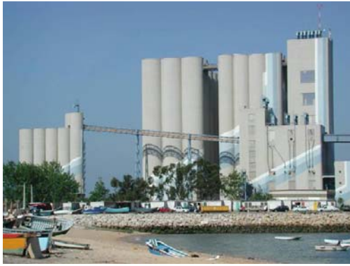
Figure 1. Trafaria Deep Water Terminal (TDWT).