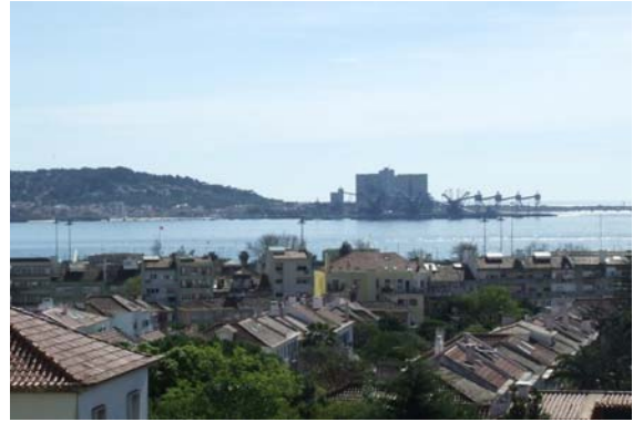
Figure 2. View from the home of Family F., located in Lisbon. Across the Tagus River is the TDWT.

The second case is more recent. Family R. lives on a horse- and bull-breeding farm, located in a zoned, rural agricultural area, 1 hour north of Lisbon. Family R. consists of mother, father, 12-year-old son, and 8-year-old daughter. In November 2006, 4 wind turbines (2MW each) were installed around Family R.'s farm, at approximately 322m, 540m, 580m and 643m from the residential home. The distance to the stables is less than to the residential house (See Fig. 3).