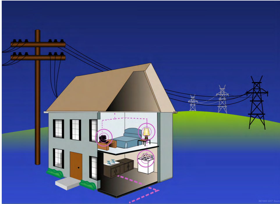
Figure 1. Common sources of ELF EMF in the home (appliances, wiring, currents running on water pipes, and nearby distribution and transmission lines)

a background EMF level as a result of the combined effect of the numerous EMF sources present in these locations.