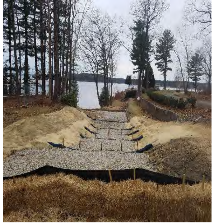
Fig 6: BMPs on slope at Gundalow landing/east side of the Bay. Viewing west. (02-04-20).