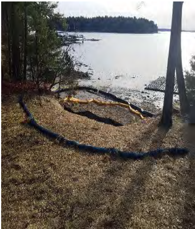
Fig 7: Turbidity barrier in intertidal zone at Gundalow landing/east side of the Bay. Viewing west. (02-05-20).