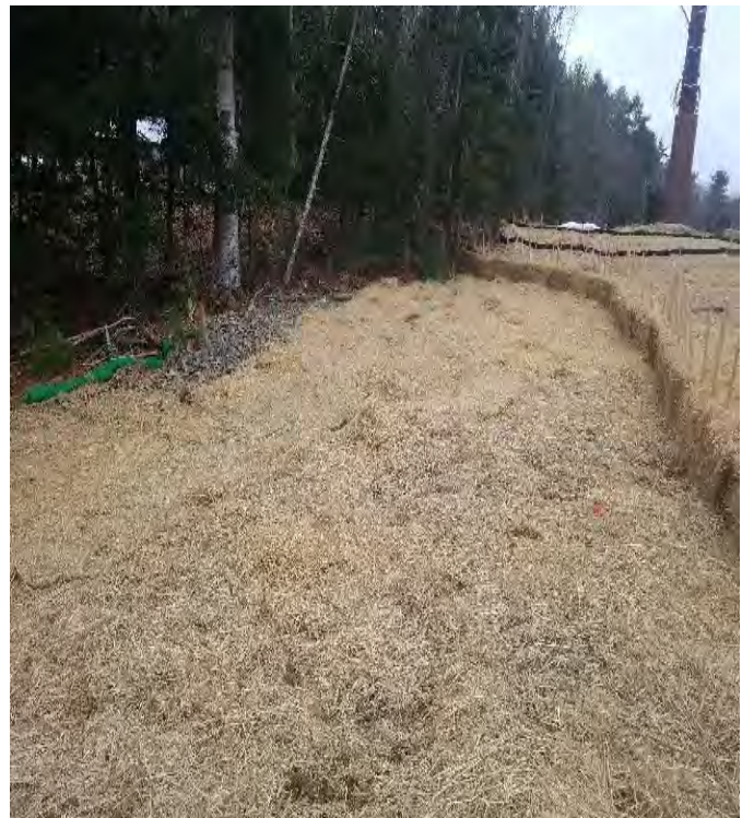
Fig 4: Straw bales and filter sock upslope of erosion at Getchell property/west side of the Bay. Viewing west. (02-04-20).