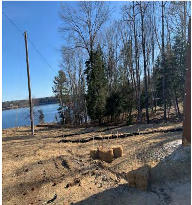
Fig 2: Crew installing sediment and erosion controls at Getchell property/west side of the bay. Next to Str. 99. Viewing east. (01-30-20).