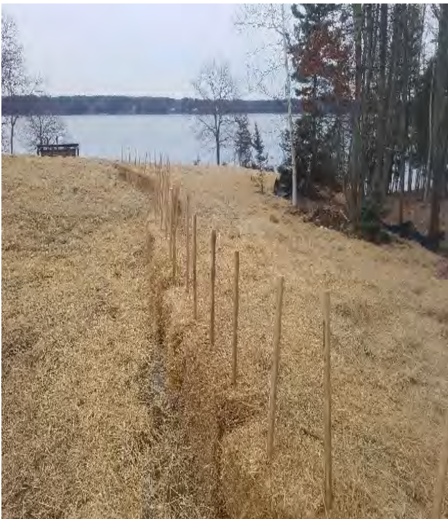
Fig 3: Straw bales installed upslope of the erosion area at the Getchell property/west side of the Bay. Viewing east. (02-04-20).