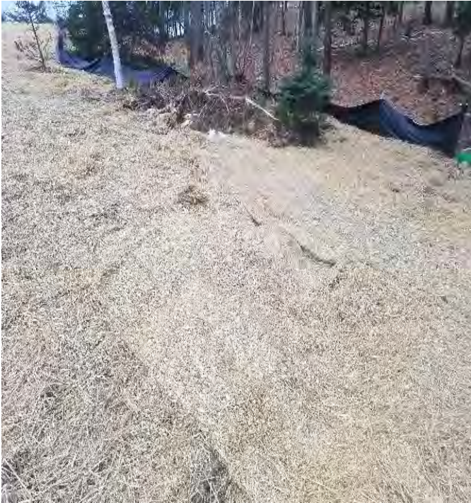
Fig 5: Erosion blanket installed over erosion area on slope at Getchell property/west side of the Bay. Viewing southeast. (02-04-20).