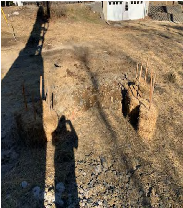
Fig 1: Crew installing sediment and erosion controls at Getchell property/west side of the bay. Viewing north. (01-30-20).