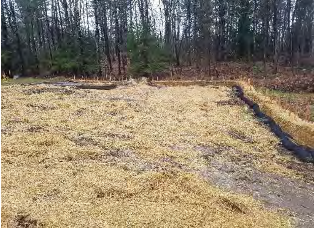
Fig 5: Str. 93 work area. Viewing north. (04-13-20).