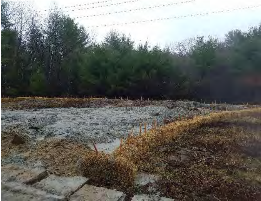
Fig 9: Drill spoils from drilling foundation for Str. 48. Viewing south. (04-13-20).