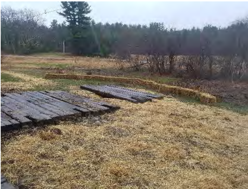
Fig 2: Str. 95 work area. Viewing south. (04-13-20).