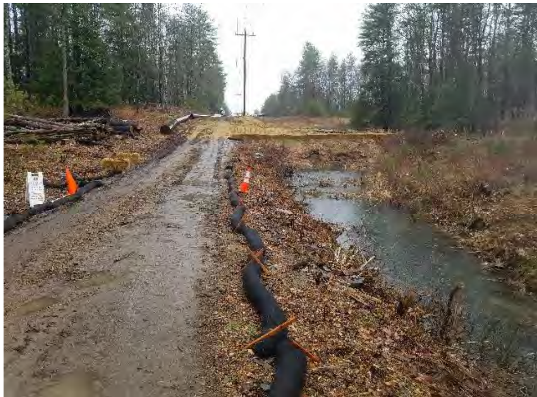
Fig 4: Access road to Str. 93 with wetland DW16 to the right. Viewing northwest. (04-13-20).