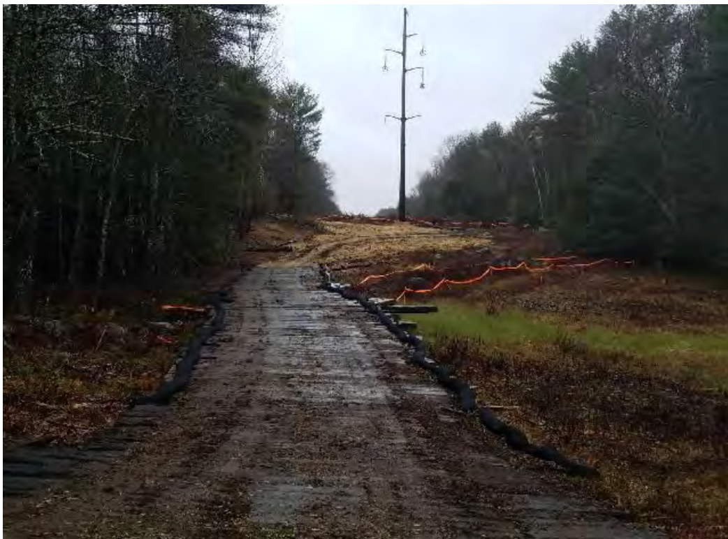
Fig 8: Access road between Strs.74 and 75, through wetland DW21. Viewing east. (04-13-20).