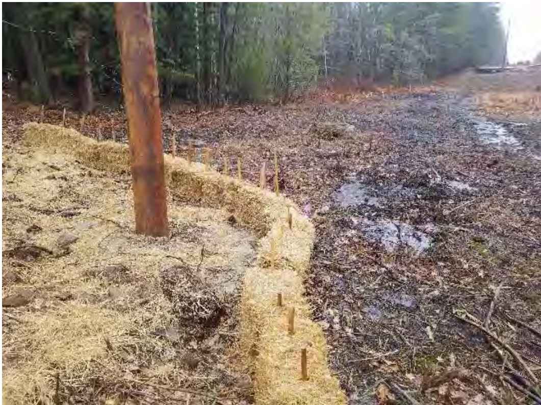
Fig 6: Distribution pole 3162-51 foundation bordering wetland DW18. Viewing west. (04-13-20).