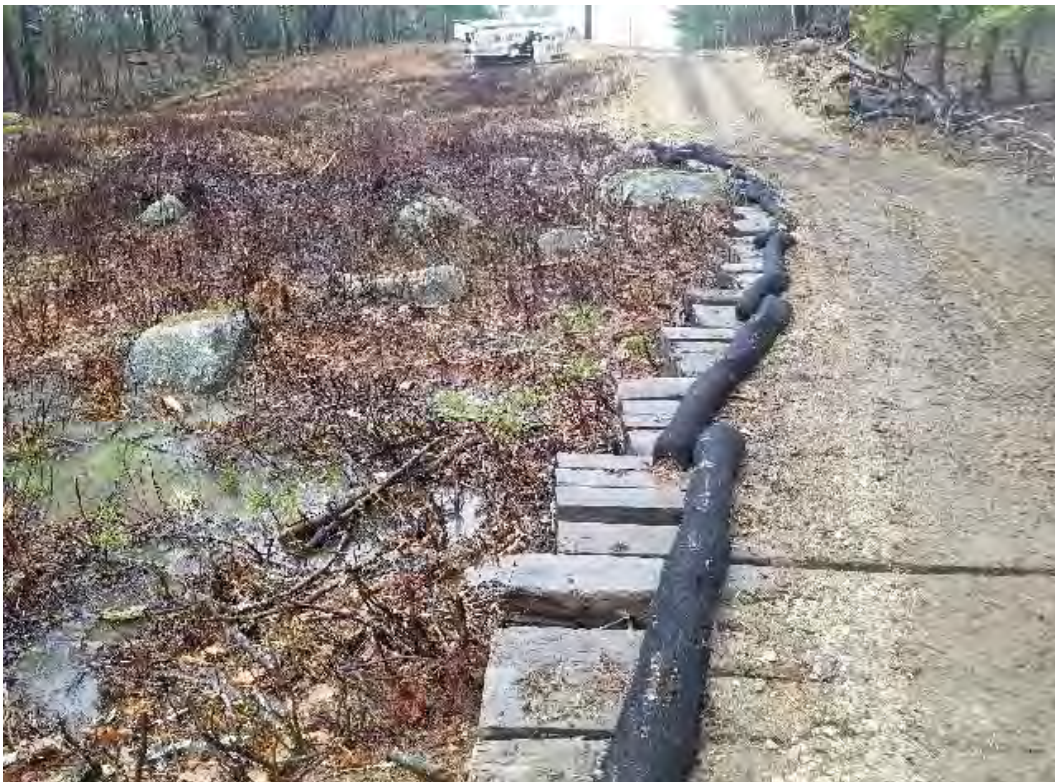
Fig 12: Turbidity observed in wetland DW31. Neighboring access road between Strs 55 and 56. Viewing southwest. (04-13-20).