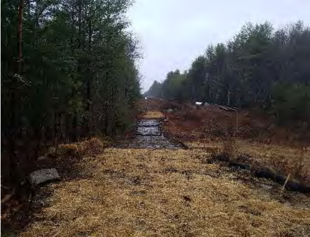
Fig 7: Access road between Strs. 85 and 84, through wetland DW30. Viewing west. (04-13-20).