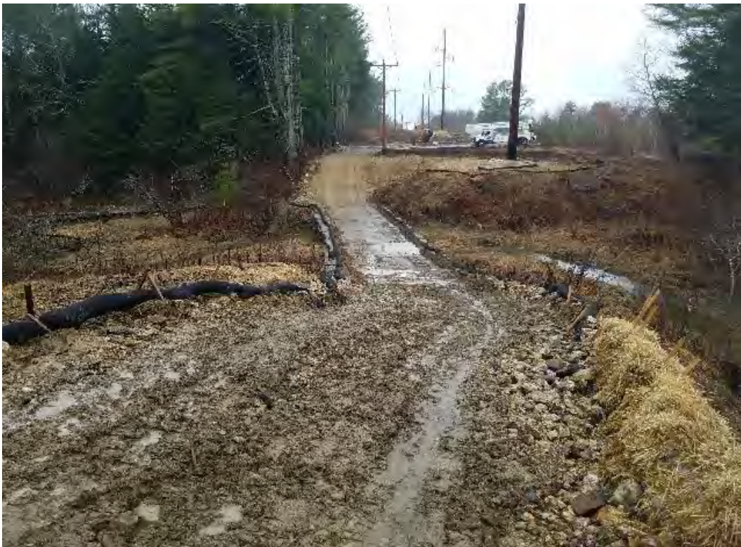
Fig 10: Access road between Strs. 51 and 52. Exposed soil needs protection. Viewing west. (04-13-20).