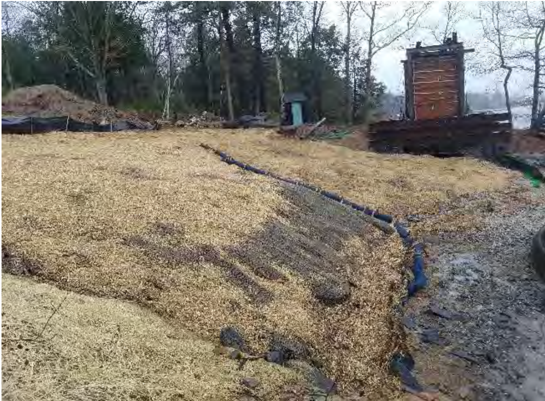
Fig 1: BMPs at toe of slope at Getchell property/west side of the Bay. Viewing north. (04-13-20).