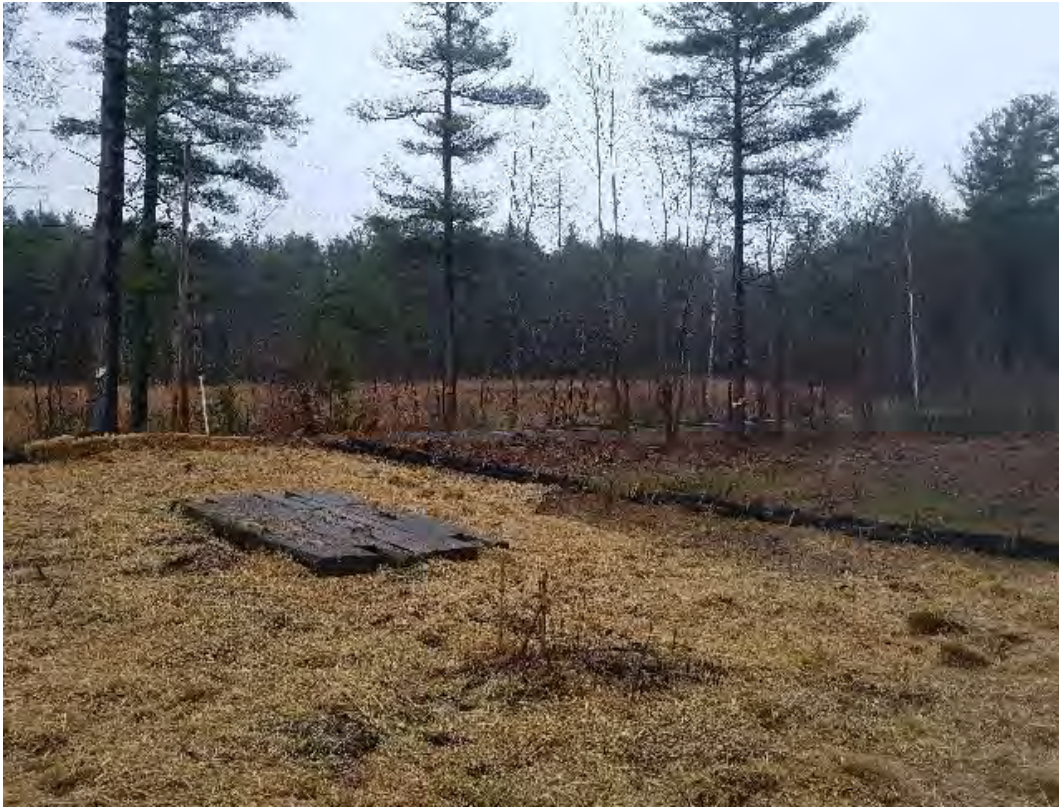
Fig 3: Str. 94 work area. Viewing east. (04-13-20).