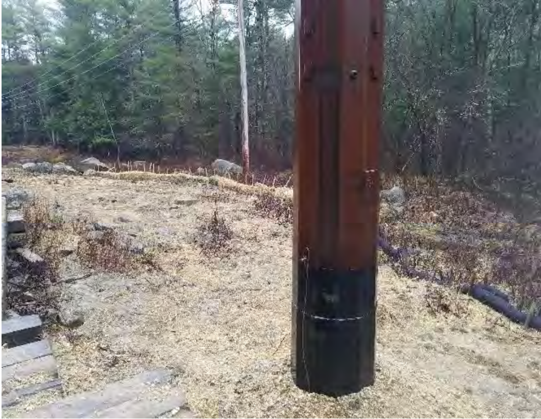
Fig 11: Str. 53 foundation and work area. Viewing east. (04-13-20).