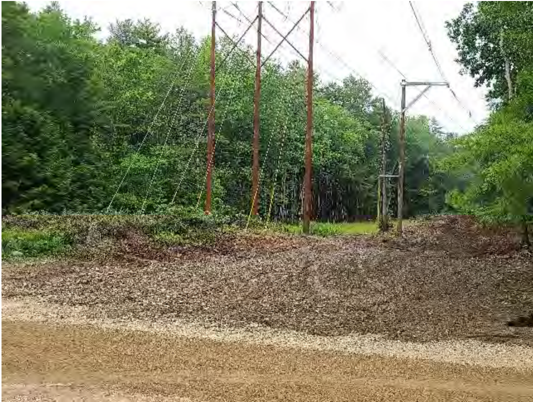
Fig 1: Restoration complete at Str. 98. Viewing west. (07-23-20).