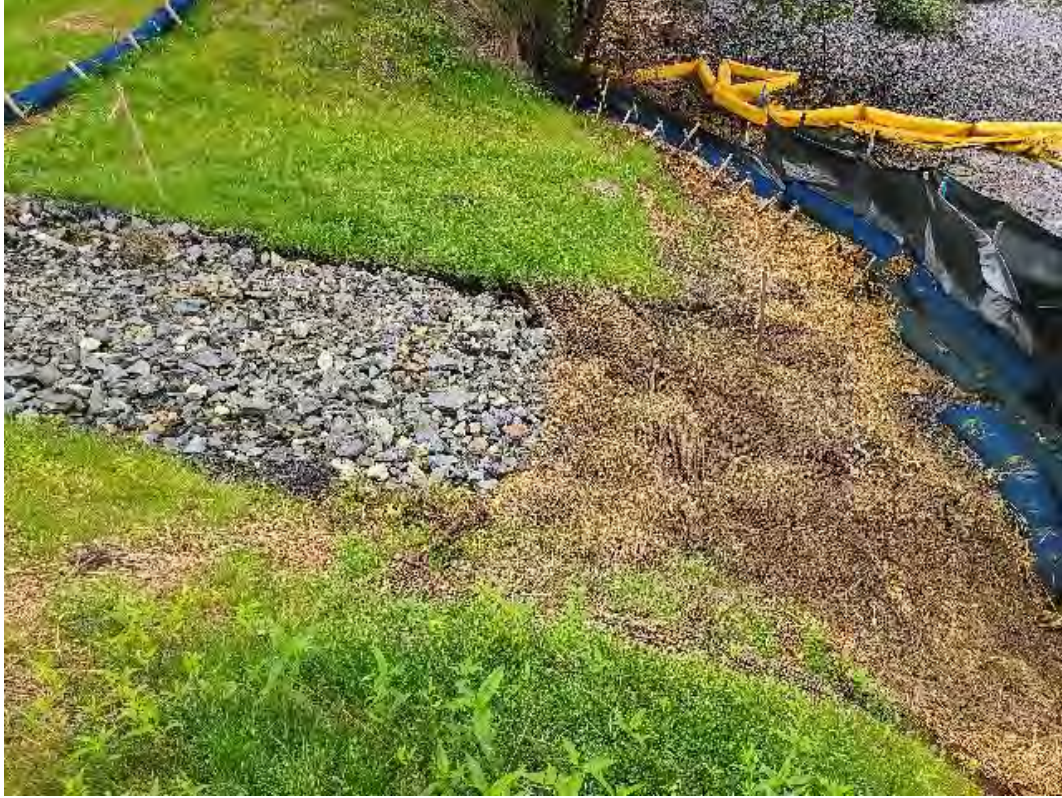
Fig 5: Toe of slope at Gundalow Landing/east side of the bay. Viewing southeast. (07-23-20).