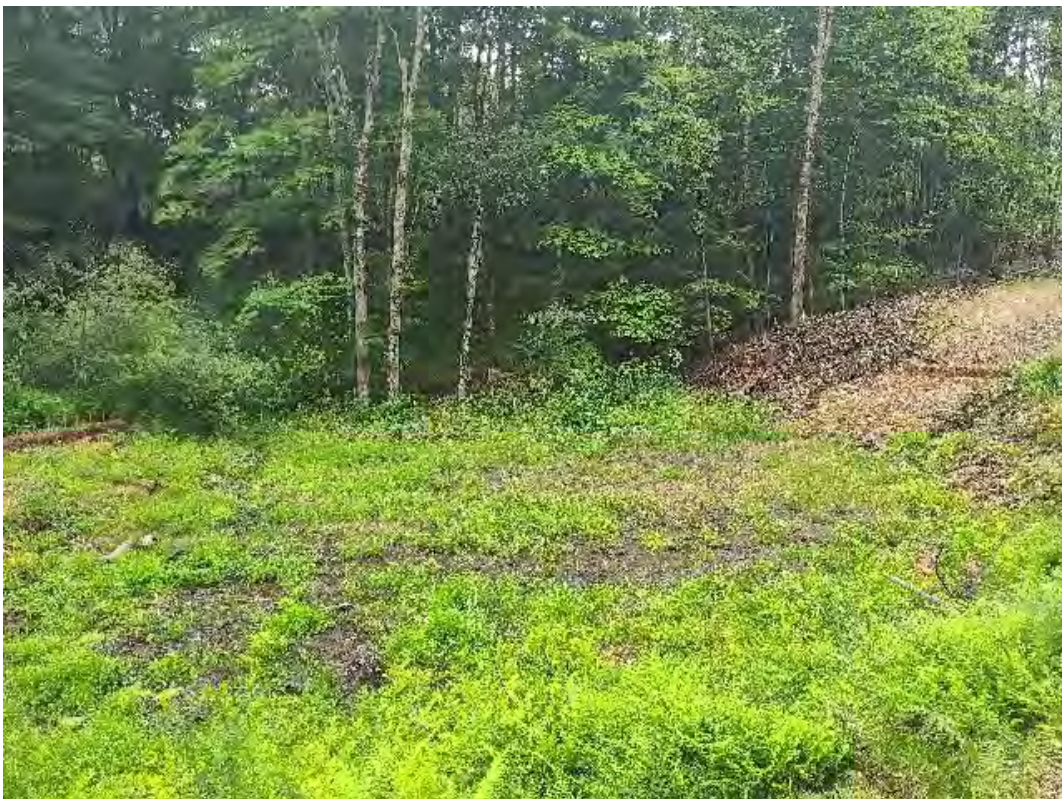
Fig 2: Wetland DW49 at Str. 28. Viewing southeast. (07-23-20).