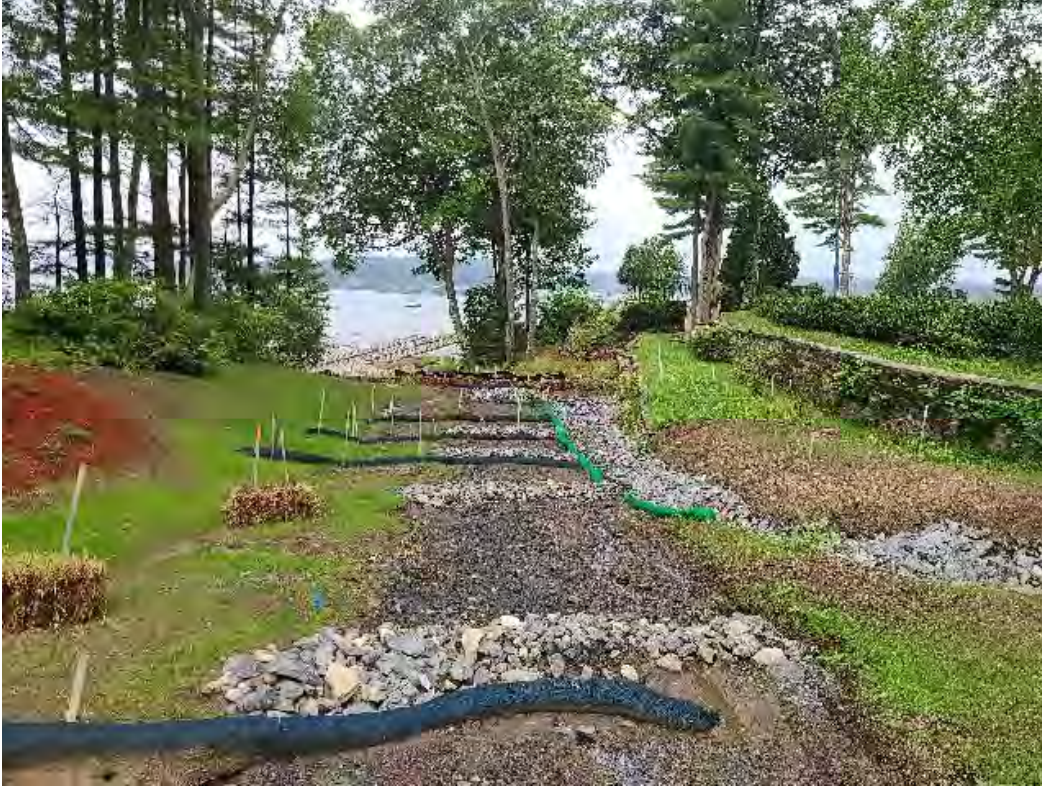
Fig 3: Slope above manhole at Gundalow Landing/east side of the bay. Viewing west. (07-23-20).