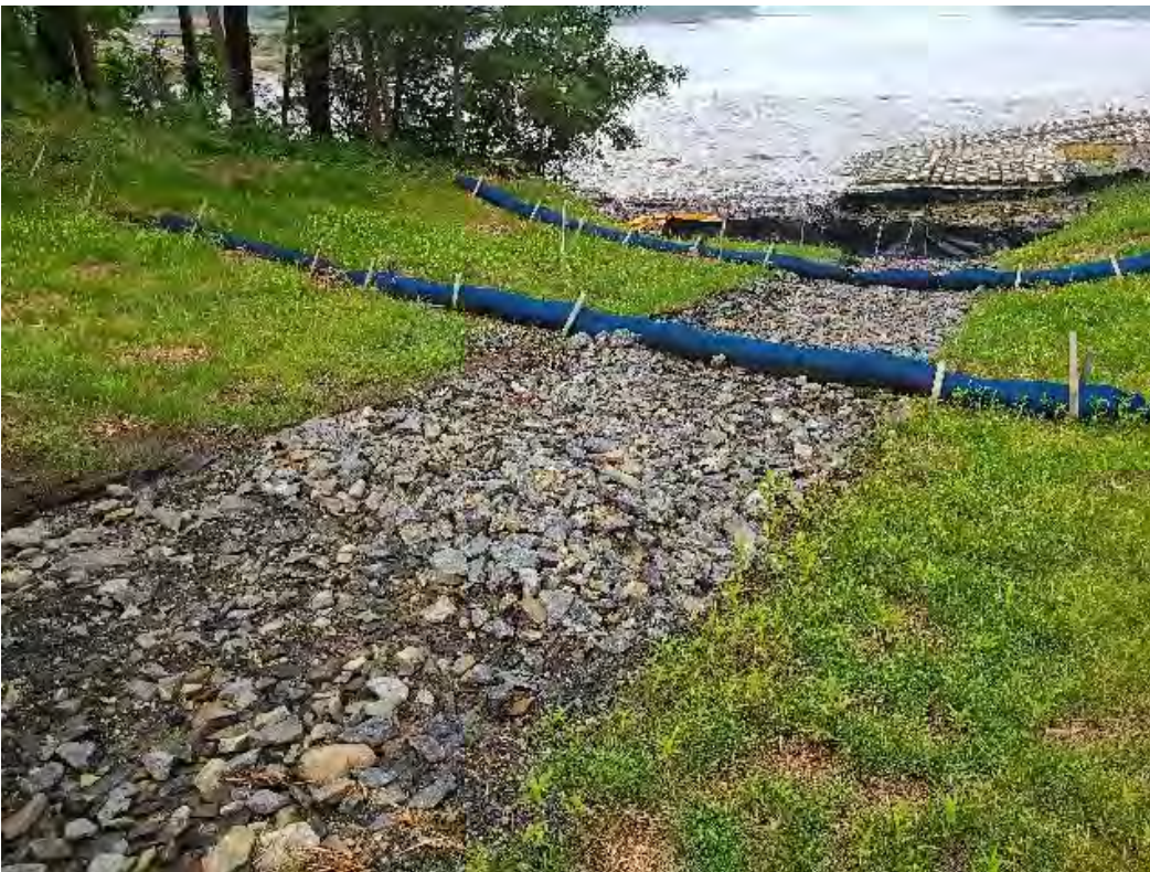
Fig 4: Slope below manhole at Gundalow Landing/east side of the bay. Viewing south. (07-23-20).