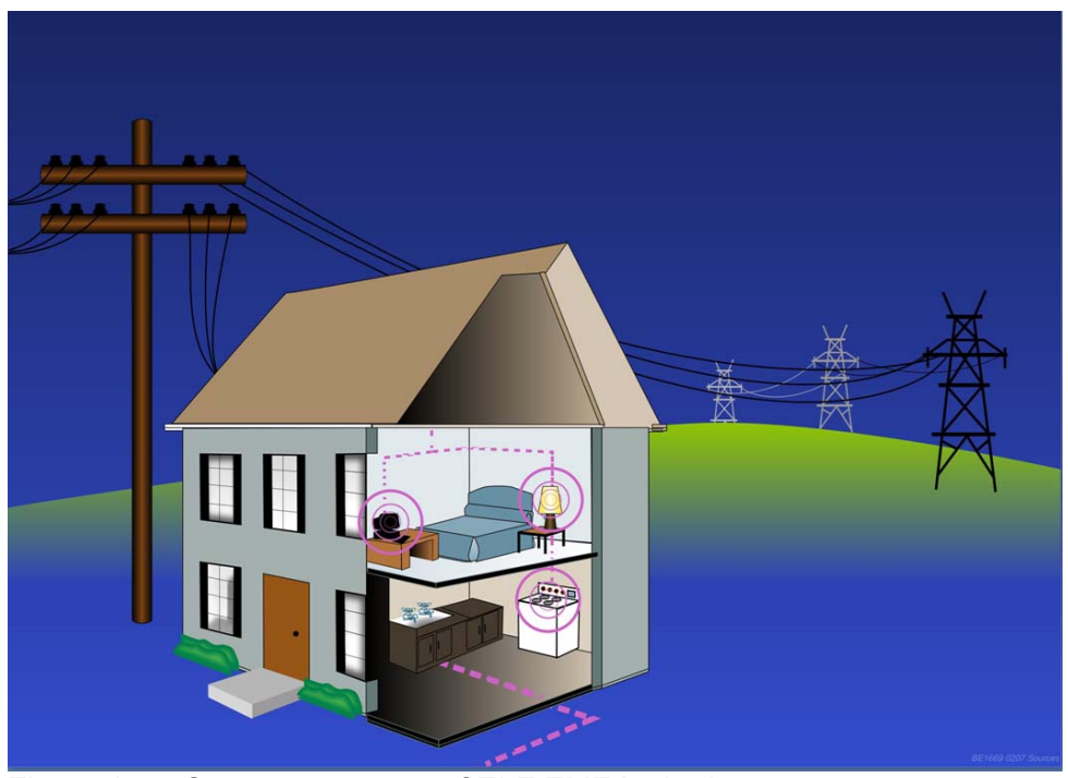
Figure 1. Common sources of ELF EMF in the home (appliances, wiring, currents running on water pipes, and nearby distribution and transmission lines)

a background EMF level as a result of the combined effect of the numerous EMF sources present in these locations.