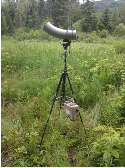
Figure 1. Transition Station 4B - overview.