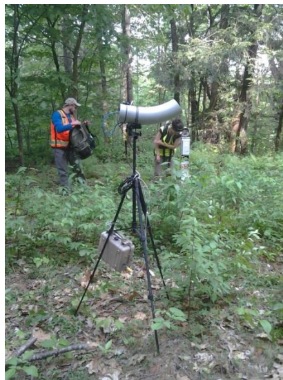
Figure 4. Franklin Converter Station B – facing east.