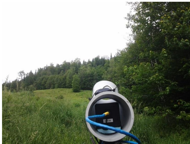
Figure 2. Transition Station 4A – cone of detection.