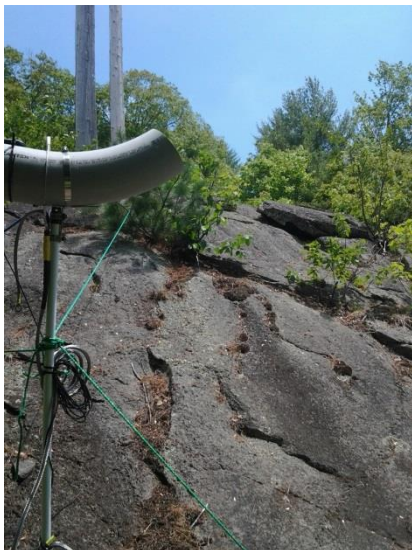
Figure 5. New Hampton DC-1185 Structure – facing south.