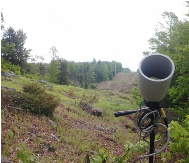
Figure 3. Deerfield structure 259 – facing east.