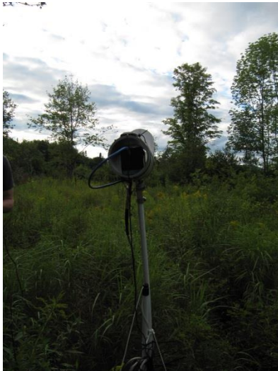
Figure 3. Bethlehem Transition Station 5 Site B – facing north.