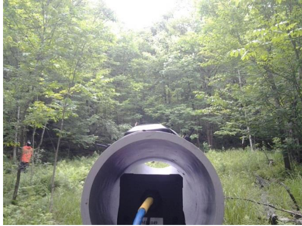
Figure 2. Transition Station 1B – cone of detection.