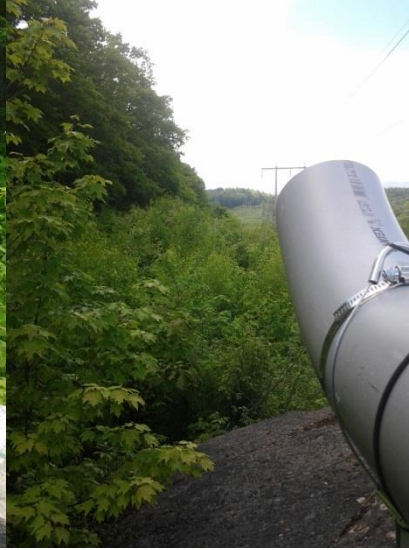
Figure 2. Franklin Structure 325 – cone of detection.