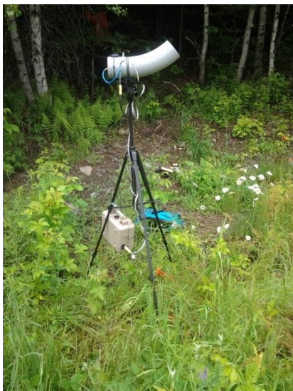
Figure 3. Transition Station 4B – facing north.