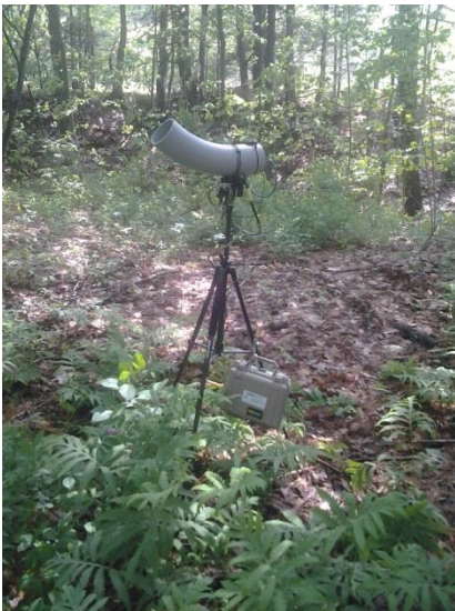
Figure 1. Bridgewater Station 6 A – overview.