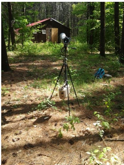
Figure 5. Franklin Converter Station A – facing south.