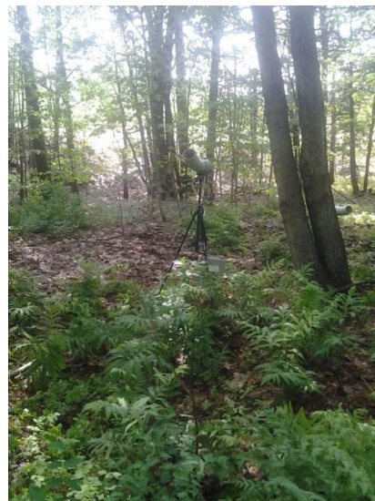
Figure 6. Bridgewater Station 6 A – facing west.