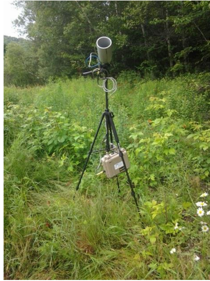
Figure 6. Transition Station 4B – facing west.