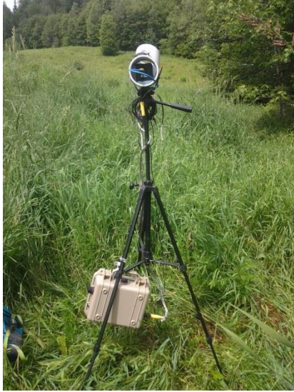
Figure 3. Transition Station 4A – facing north.