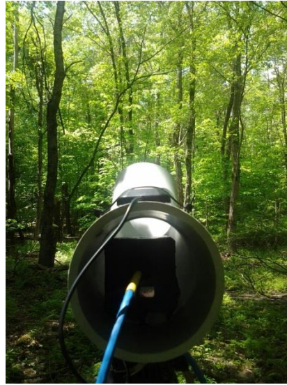
Figure 2. Deerfield Substation B – cone of detection.