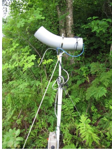
Figure 4. Bethlehem Transition Station 5 Site A – facing east.