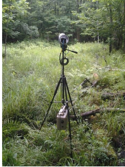
Figure 6. Transition Station 1B – facing west.