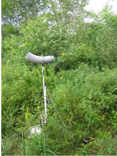
Figure 1. Bethlehem Transition Station 5 Site B – overview.