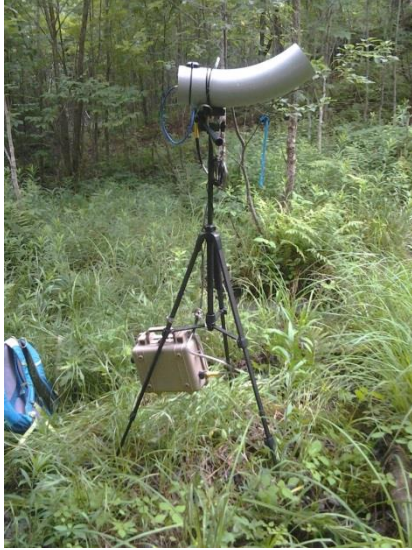
Figure 5. Transition Station 1B – facing south.