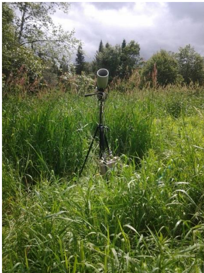
Figure 5. Transition Station 4A – facing south.