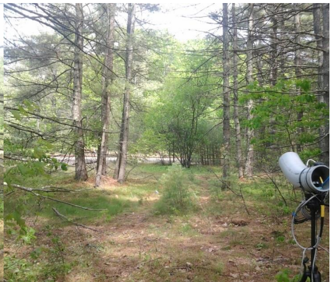
Figure 4. Bridgewater Station 6 B – facing east.