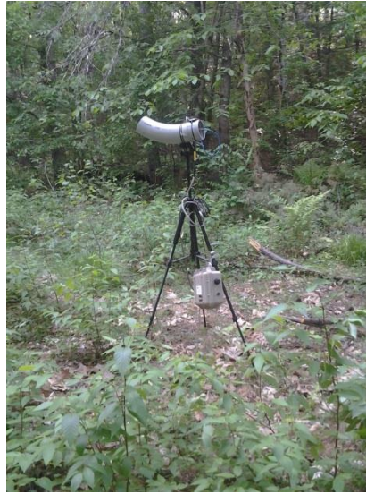
Figure 6. Franklin Converter Station B – facing west.