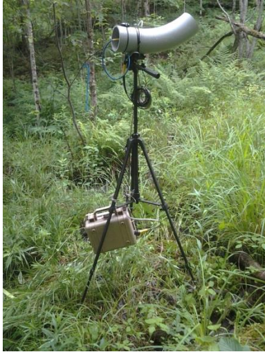
Figure 1. Transition Station 1B – overview.