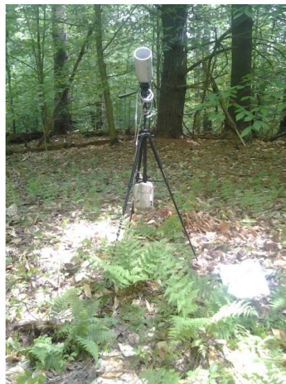
Figure 4. Deerfield Substation B – facing east.