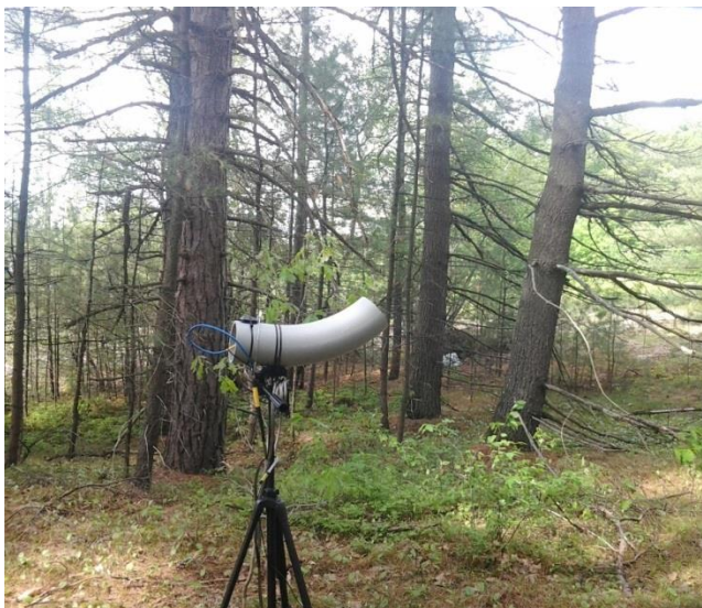
Figure 3. Bridgewater Station 6 B – facing north.