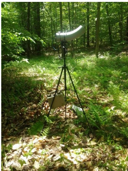
Figure 5. Deerfield Substation A - facing south.