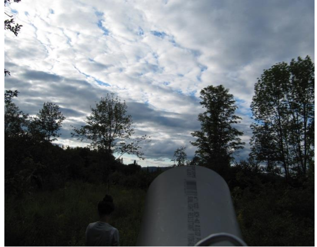
Figure 2. Bethlehem Transition Station 5 Site B – cone of detection.