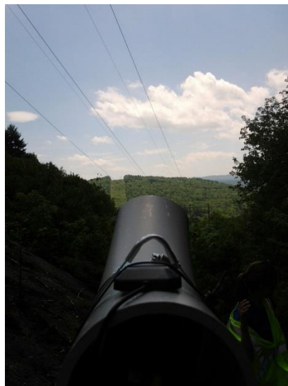
Figure 2. New Hampton DC-1185 Structure – cone of detection.