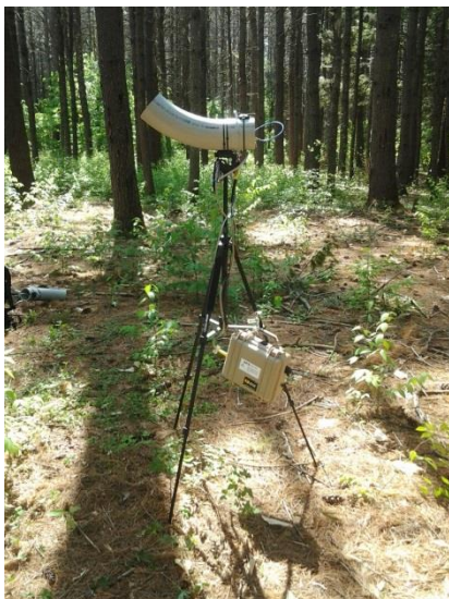
Figure 1. Franklin Converter Station A – overview.