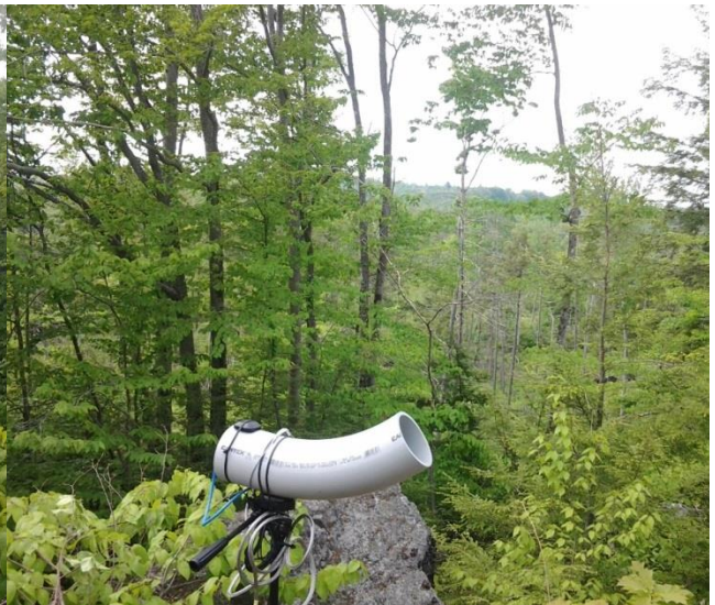
Figure 4. Deerfield structure 259 – facing south.