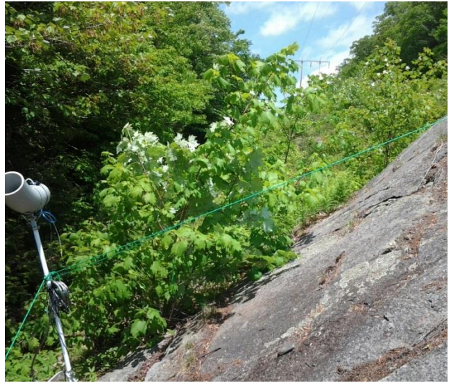
Figure 4. New Hampton DC-1185 Structure – facing east.