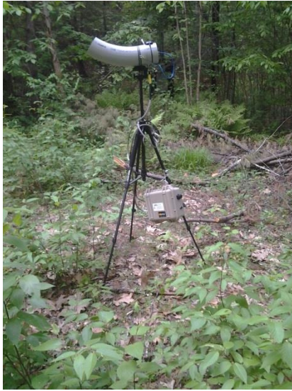
Figure 1. Franklin Converter Station B – overview.