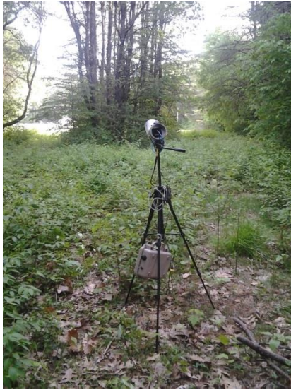
Figure 5. Franklin Converter Station B – facing south.