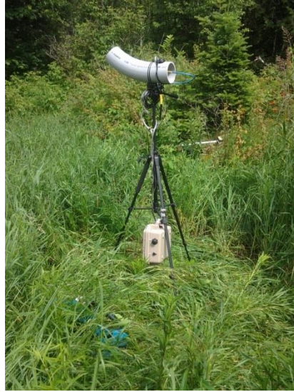
Figure 4. Transition Station 4A – facing east.