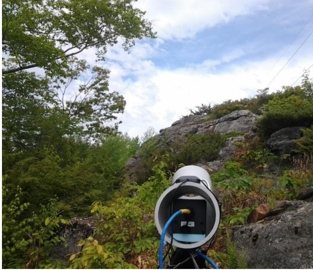
Figure 1. Deerfield structure 259 – cone of detection.