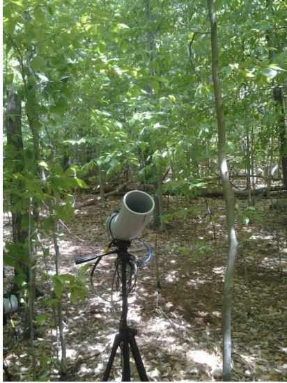
Figure 3. Deerfield Substation A - facing north.