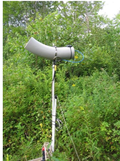
Figure 4. Bethlehem Transition Station 5 Site B – facing east.