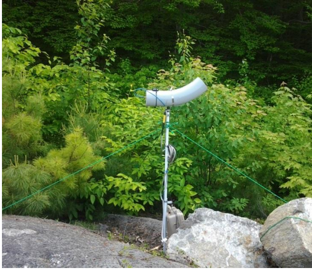
Figure 1. Franklin Structure 325 – overview.