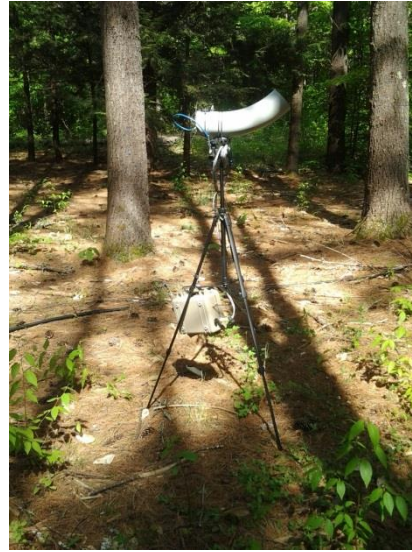
Figure 4. Franklin Converter Station A – facing east.