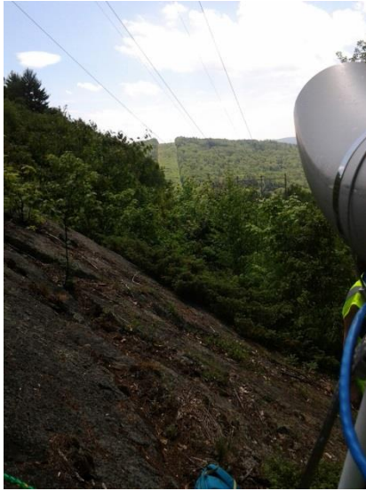
Figure 3. New Hampton DC-1185 Structure – facing north.