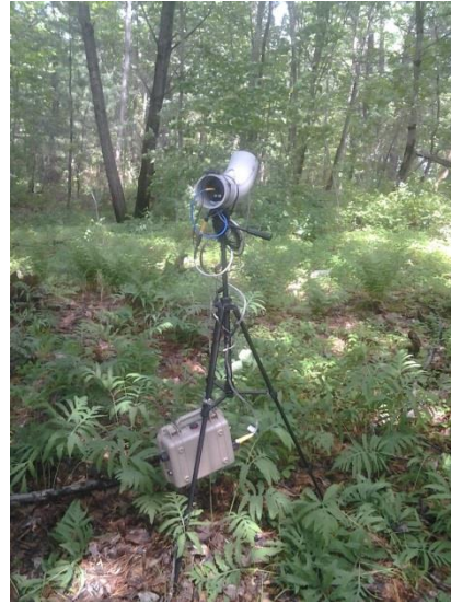
Figure 4. Bridgewater Station 6 A – facing east.