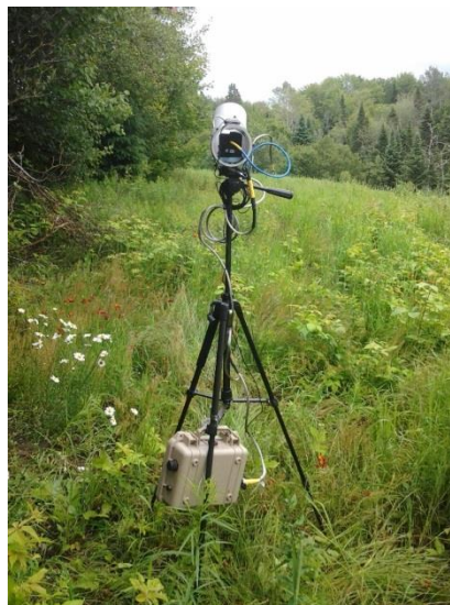
Figure 4. Transition Station 4B – facing east.