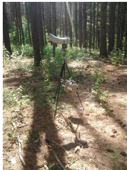
Figure 6. Franklin Converter Station A – facing west.