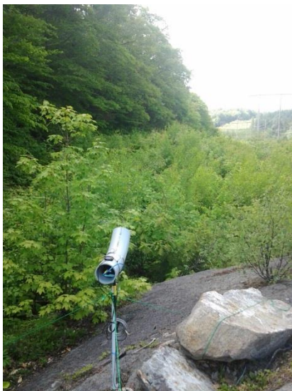
Figure 3. Franklin Structure 325 – facing north.