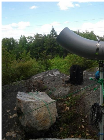
Figure 4. Franklin Structure 325 – facing east.