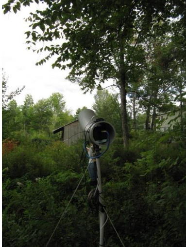
Figure 3. Bethlehem Transition Station 5 Site A – facing north.