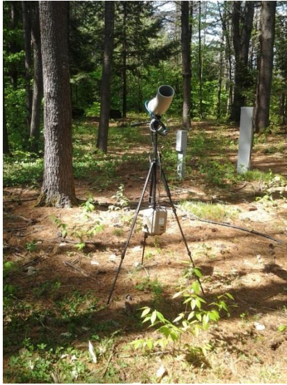
Figure 3. Franklin Converter Station A – facing north.