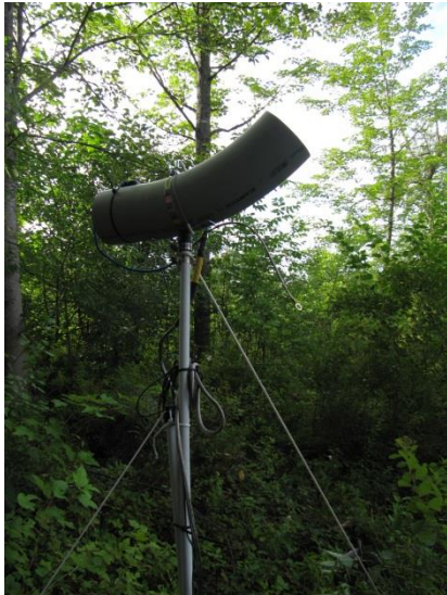
Figure 1. Bethlehem Transition Station 5 Site A - overview.