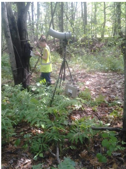
Figure 5. Bridgewater Station 6 A – facing south.