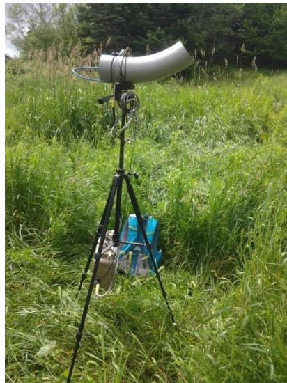
Figure 6. Transition Station 4A – facing west.