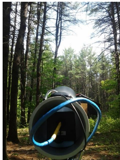
Figure 2. Franklin Converter Station A – cone of detection.