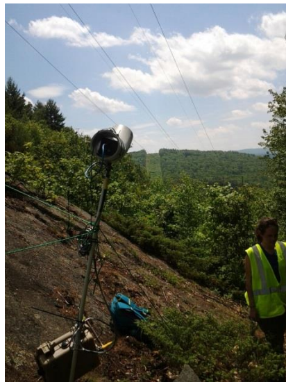
Figure 6. New Hampton DC-1185 Structure – facing west.