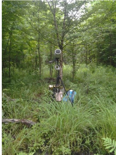
Figure 4. Transition Station 1B – facing east.