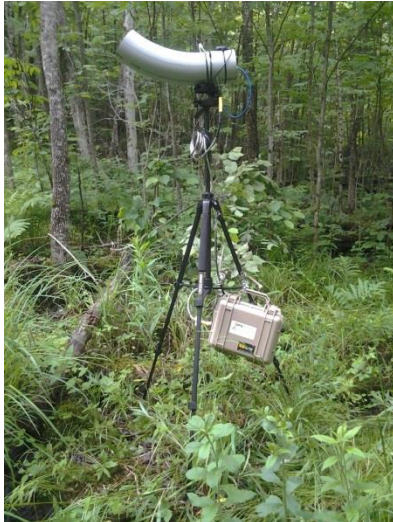
Figure 3. Transition Station 1B – facing north.