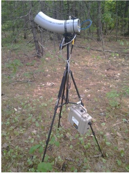
Figure 1. Bridgewater Station 6 B - overview.