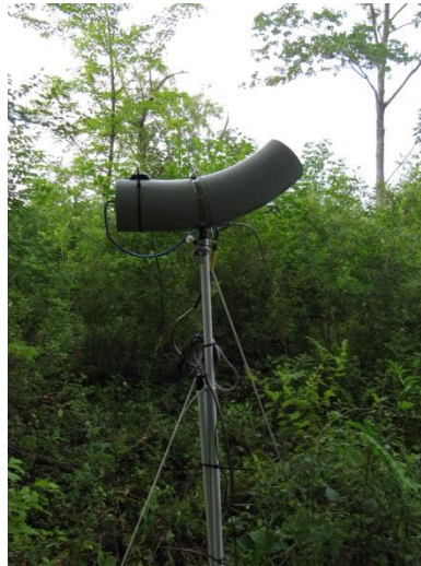
Figure 6. Bethlehem Transition Station 5 Site A – facing west.