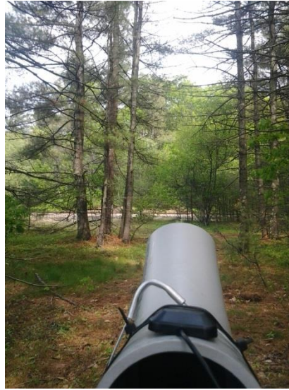
Figure 2. Bridgewater Station 6 B – cone of detection.