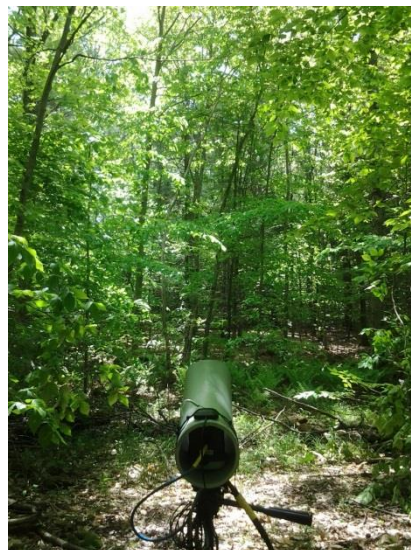
Figure 2. Deerfield Substation A - cone of detection.