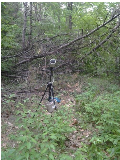
Figure 3. Franklin Converter Station B – facing north.