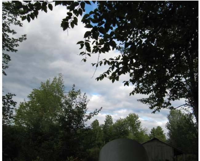
Figure 2. Bethlehem Transition Station 5 Site A – cone of detection.