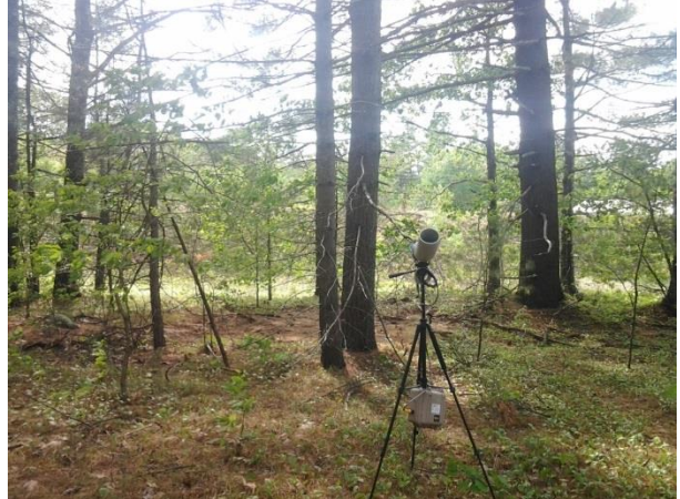
Figure 6. Bridgewater Station 6 B – facing west.