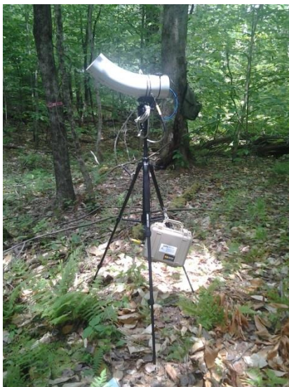
Figure 3. Deerfield Substation B – facing north.