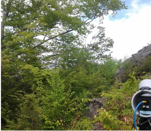
Figure 5. Deerfield structure 259 – facing west.