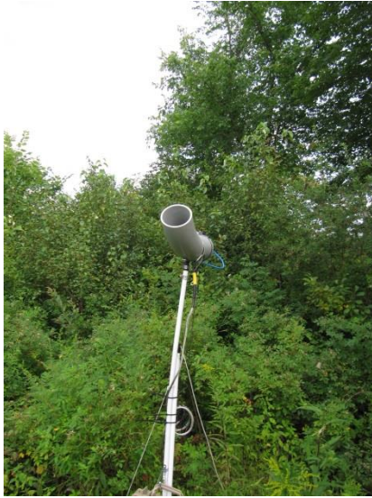
Figure 5. Bethlehem Transition Station 5 Site B – facing south.