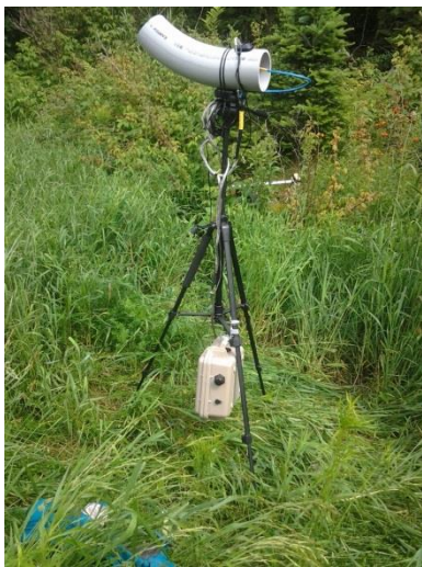
Figure 1. Transition Station 4A – overview.