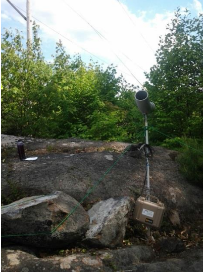
Figure 5. Franklin Structure 325 – facing south.