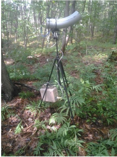
Figure 3. Bridgewater Station 6 A – facing north.