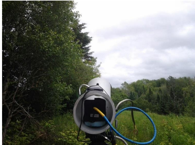
Figure 2. Transition Station 4B – cone of detection.