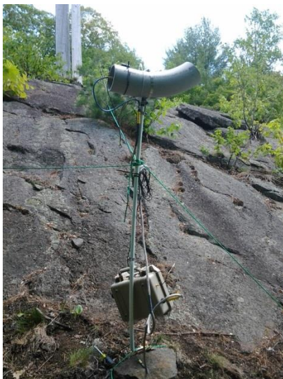
Figure 1. New Hampton DC-1185 Structure – overview.