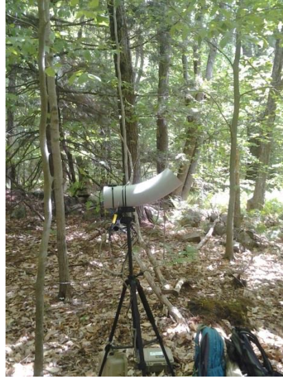
Figure 4. Deerfield Substation A - facing east.