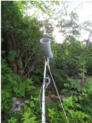
Figure 5. Bethlehem Transition Station 5 Site A – facing south.