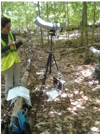
Figure 1. Deerfield Substation A - overview.