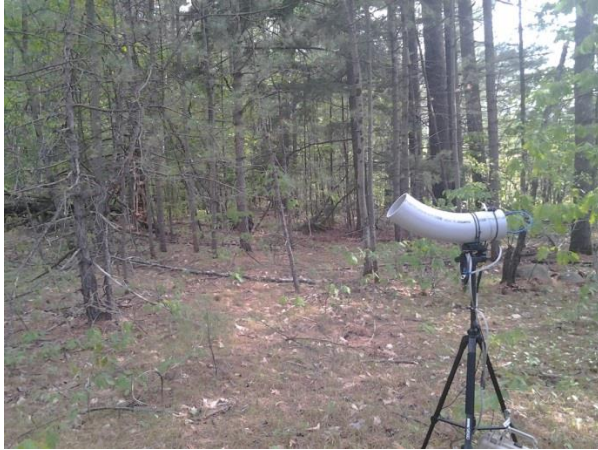
Figure 5. Bridgewater Station 6 B – facing south.