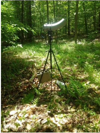
Figure 5. Deerfield Substation B – facing south.