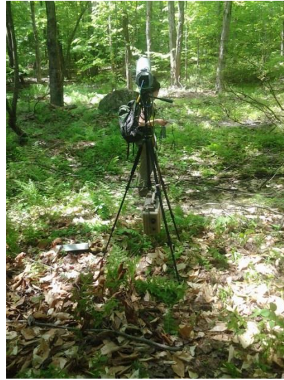
Figure 6. Deerfield Substation B – facing west.