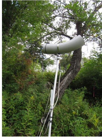
Figure 6. Bethlehem Transition Station 5 Site B – facing west.