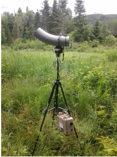
Figure 5. Transition Station 4B – facing south.