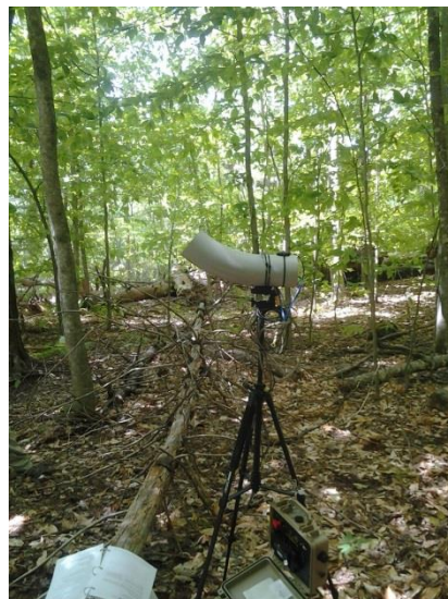
Figure 6. Deerfield Substation A - facing west.