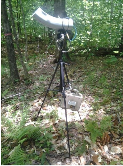
Figure 1. Deerfield Substation B - overview.