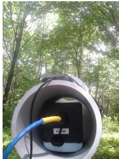
Figure 2. Bridgewater Station 6 A – cone of detection.