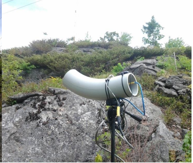
Figure 2. Deerfield structure 259 – facing north.