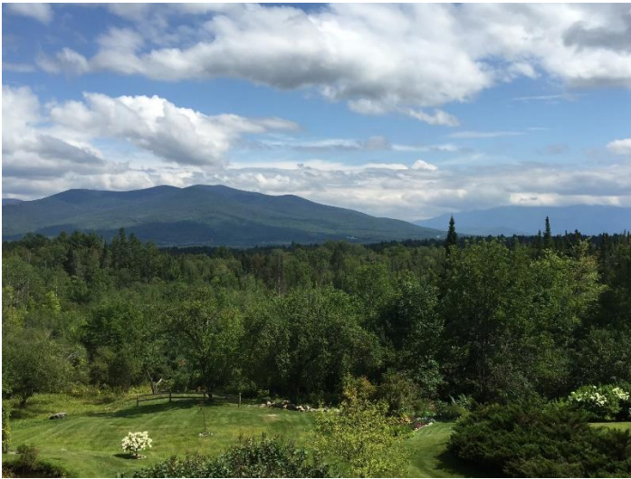
Figure 4 View from back of house. The ROW runs from left to right at tree line.