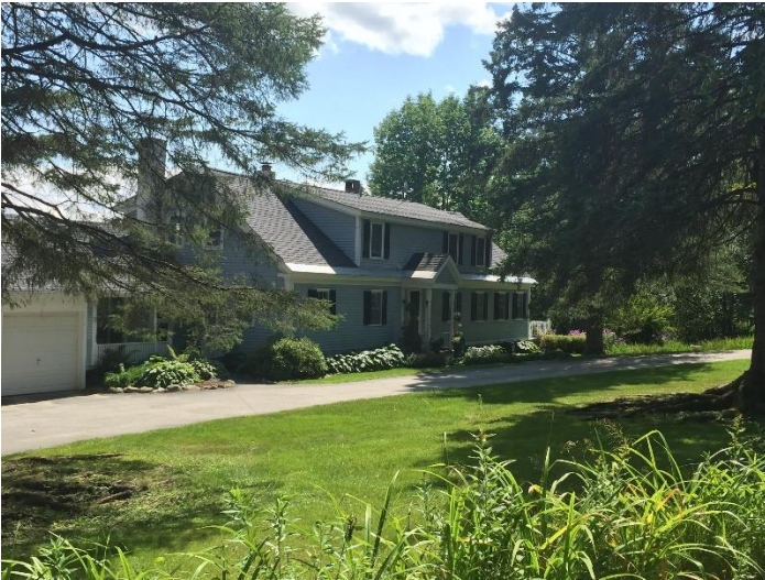
Figure 2 185 Mount Prospect Rd, 2015