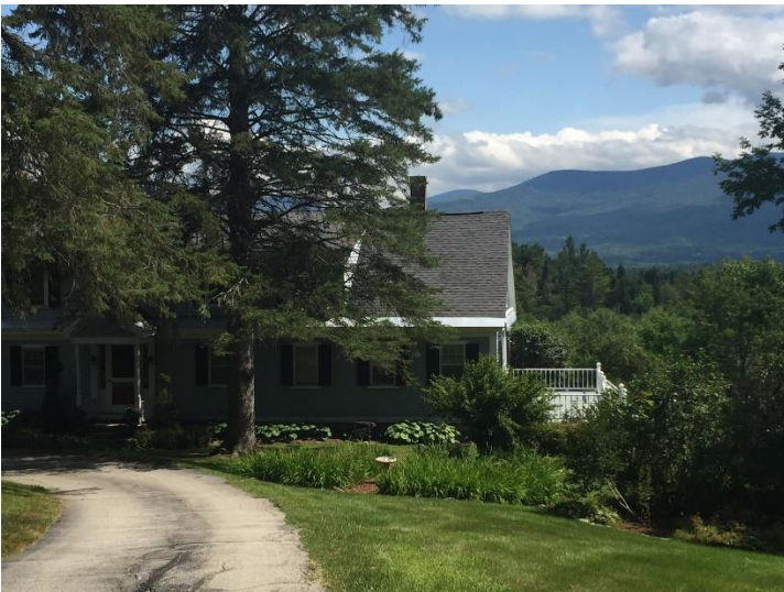
Figure 3 Front of house with view from side deck of the existing row.