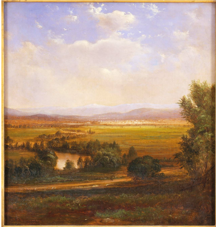
Robert Duncanson, Lancaster NH and Mt. Washington from Guildhall VT (1862) Museum of Fine Arts Boston (2011.1792)