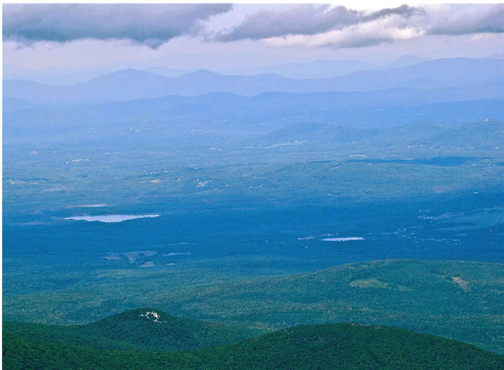
View from Mt. Washington of Pondicherry/Conte Refuge and Weeks State Park (R) taken by R. W. S. More from the Mt. Washington Observatory, July 2012