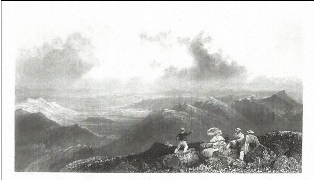
William H. Bartlett, "Mt Jefferson from Mt. Washington", 1835, engraving from N. P. Willis, American Scenery; or Land, Lake and River, Illustrations of Transatlantic Nature , vol. II, London, George Virtue, 1840, p. 25. Note: Pondicherry Lake in middle.