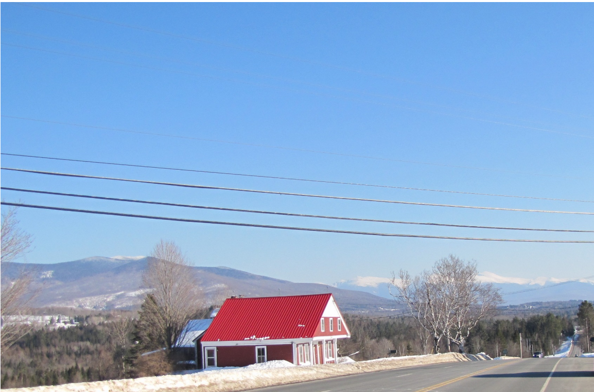
S. Gotham House just before NH Rte 2 Scenic Overlook, taken February 18, 2017