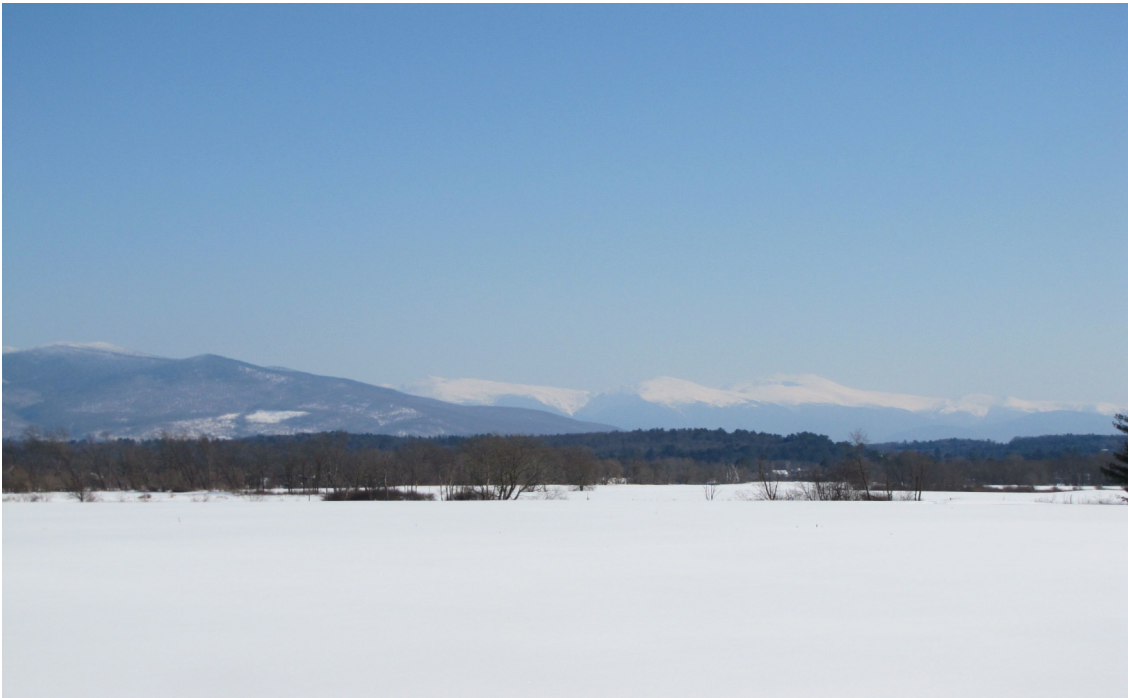
Israel's River Valley & Mt. Washington from Guildhall VT, February 18 2017