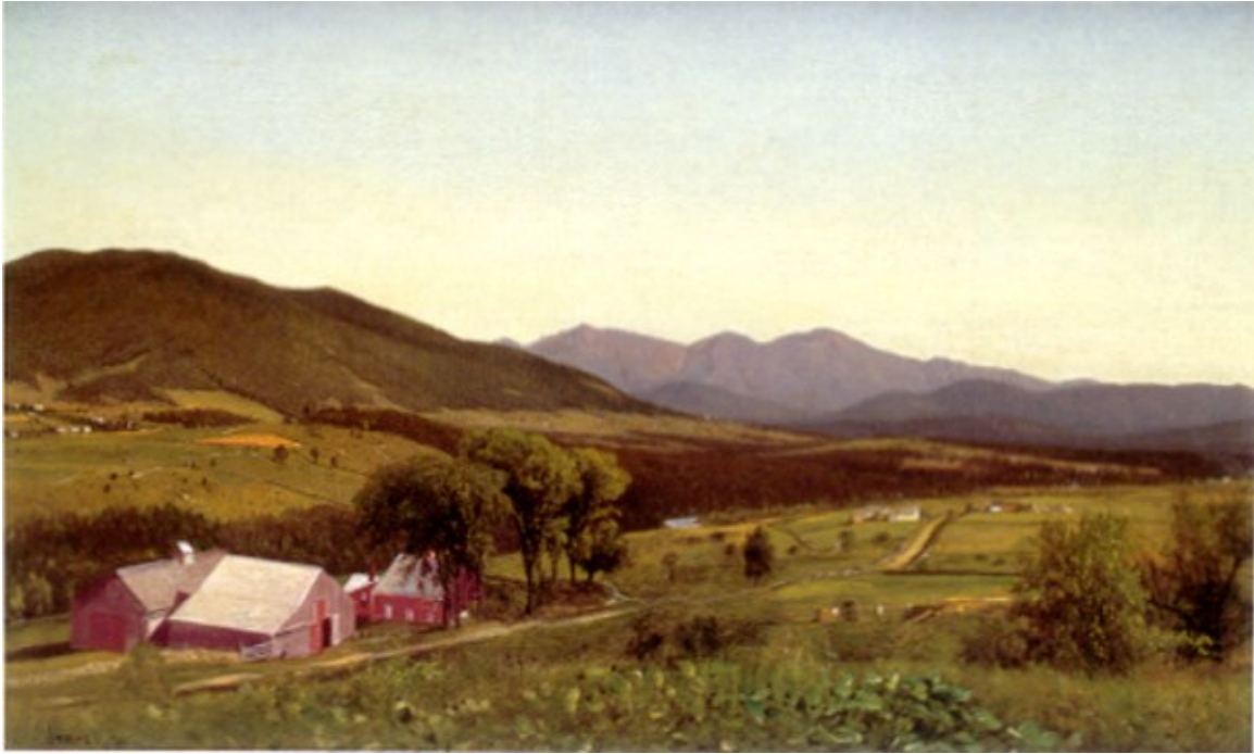
James McDougal Hart, Mt. Washington from LeGro Hill (1867) with Rte 2 and the S. Gotham House