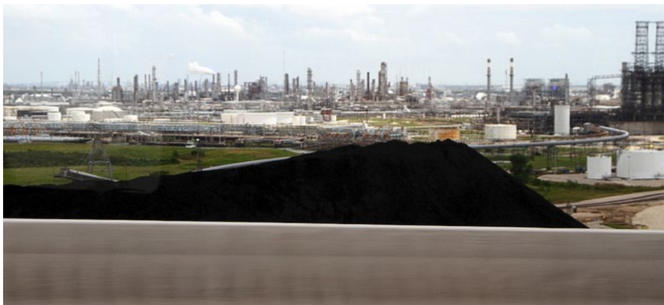
Kinder Morgan’s coal piles rise above Houston’s Beltway 8 Bridge.

Although the source of pollution cannot be definitively proven, there are reasons to think that it may have originated at the coal and petcoke piles at Kinder Morgan’s facilities, which sometimes reach as high as the nearby freeway and reportedly coat passing vehicles with black dust on a regular basis. 28 In fact, a range of public interest organizations have raised concerns about both terminals, arguing that their draft permits allow them to emit 32 tons of hazardous particulate matter at Penn City and 16 tons at the Deepwater Terminal. 29