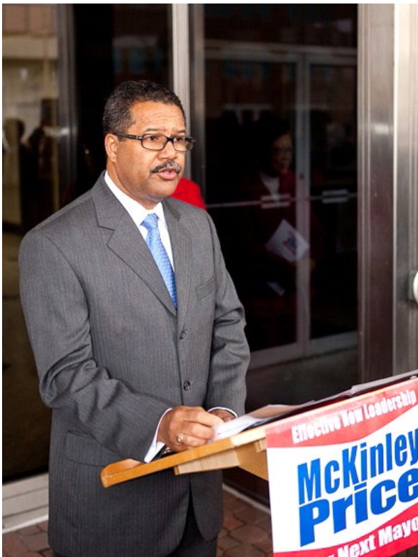
McKinley Price, Mayor of Newport News, Virginia.

In fact, the Daily Press reported that Mayor McKinley Price, who lives about a mile from the coal piers, has complained that coal dust coats his house and outdoor furniture. 40