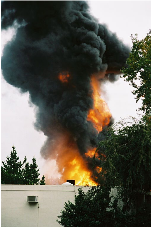
A ruptured Kinder Morgan pipeline in Walnut Creek, California, killed five people when it exploded.

In November 2004, an oil pipeline owned by a Kinder Morgan subsidiary burst in the Mojave Desert, sending a jet of fuel 80 feet into the air. The break closed the nearby interstate highway and contaminated more than 10,000 tons of soil in the habitat for federally-designated endangered species. 70