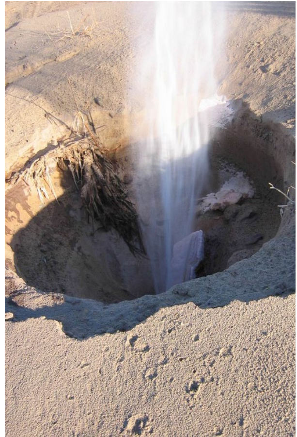
A Kinder Morgan oil pipeline ruptures in endangered species habitat in California's Mojave Desert.