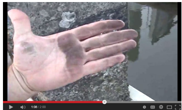
Coal dust from Kinder Morgan's coal terminal contaminates a piling at the Cooper River Marina in Charleston, South Carolina.