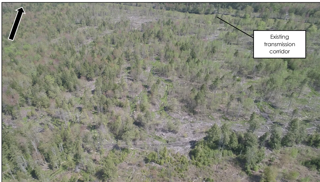
Photo 6: View of extensive harvesting from the western area of the Project footprint.