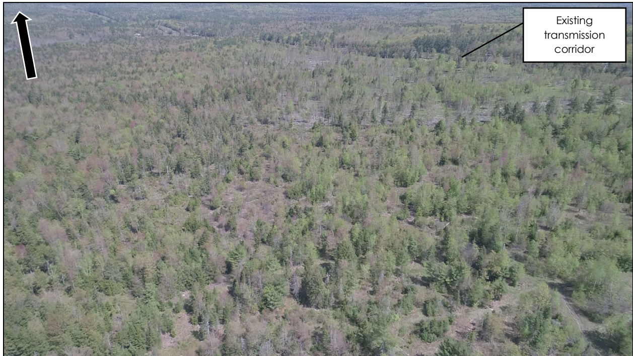
Photo 7: View of extensive harvesting from the western portion of the Project footprint.