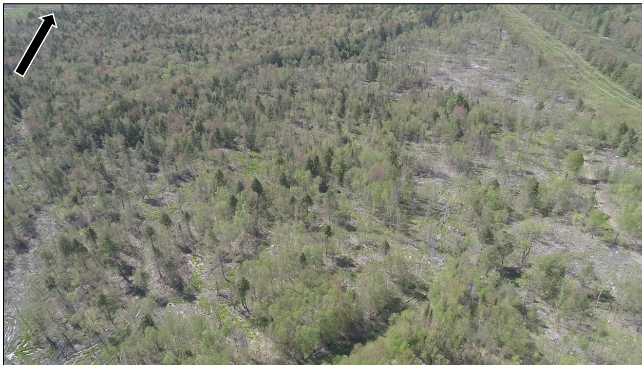
Photo 4: View of extensive harvesting throughout the Project land control area.