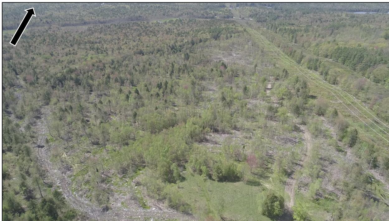
Photo 5: View of extensive harvesting from the eastern portion of the Project footprint.