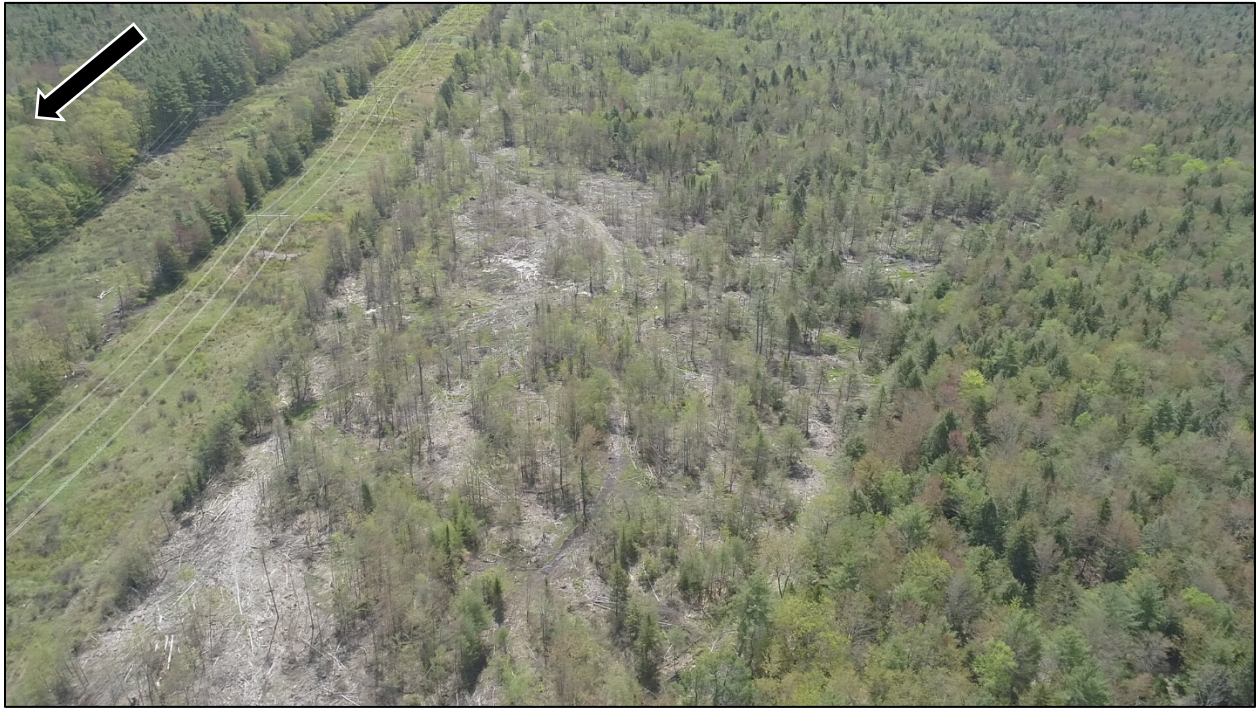
Photo 1: View of extensive harvesting in the northern portion of the Project land control area.