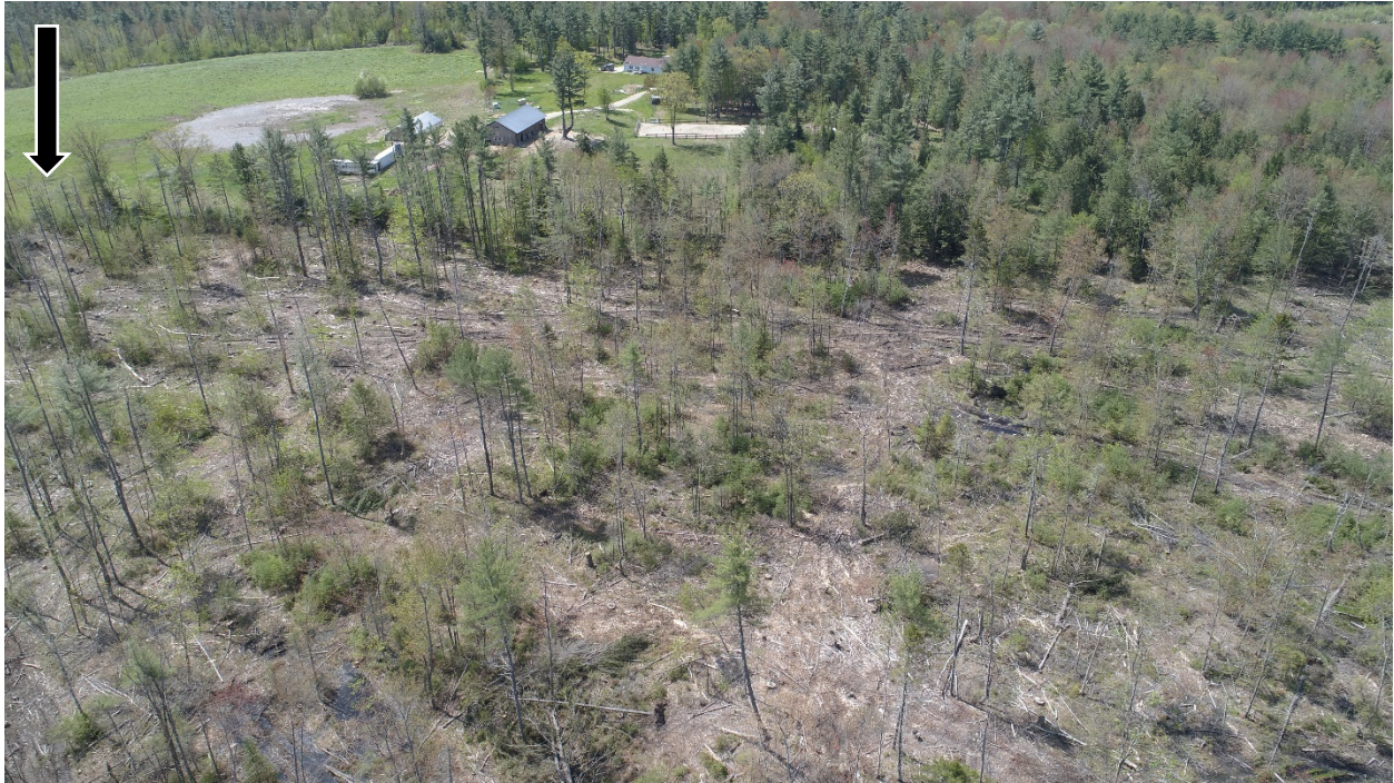
Photo 11: View of extensive timber harvesting within the southern portion of the Project footprint.