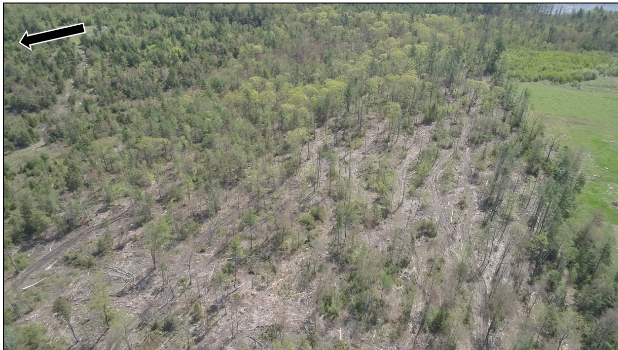
Photo 12: View of extensive harvesting in the southwestern portion of the Project footprint.