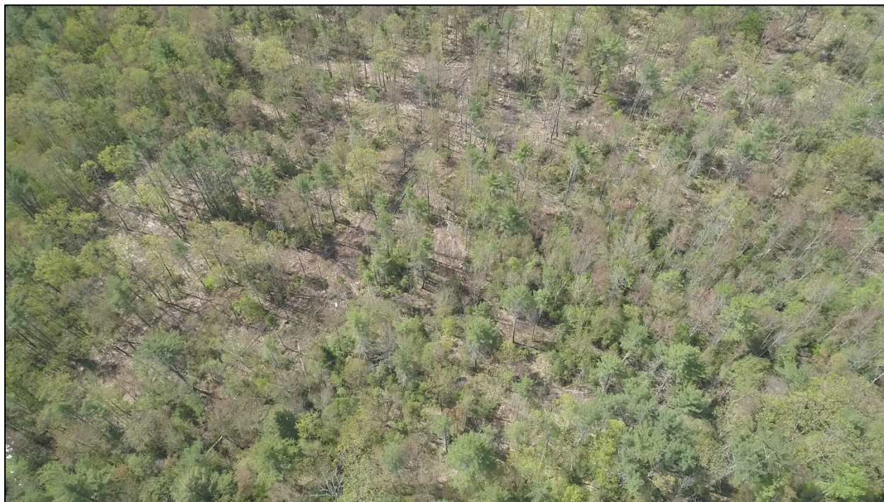
Photo 10: View looking directly down at timber harvesting within the Project footprint.