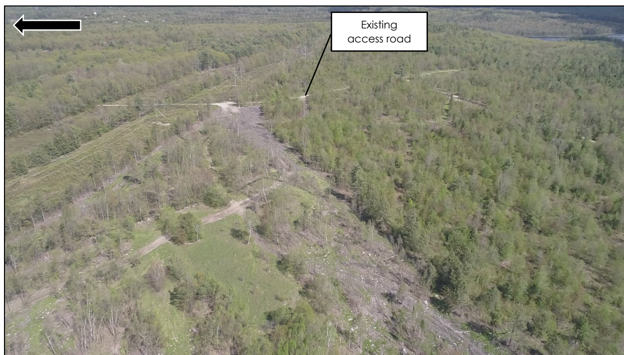
Photo 3: View of extensive harvesting in the northern portion of the Project land control area.