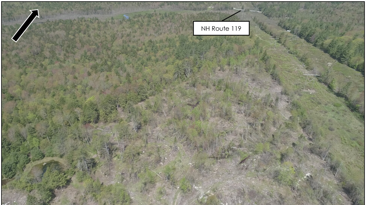
Photo 2: View of extensive harvesting in the northern portion of the Project land control area.