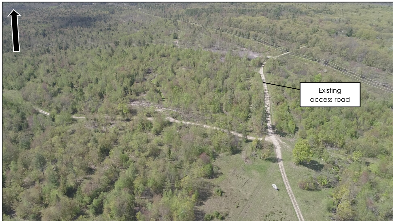
Photo 8: View of existing access road and cleared area resulting from timber harvesting.