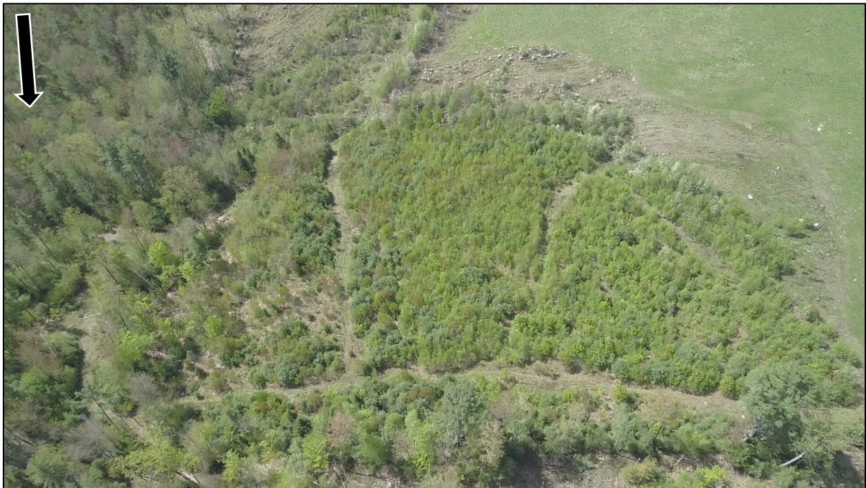
Photo 14: View of harvesting within the southeastern portion of the Project footprint.