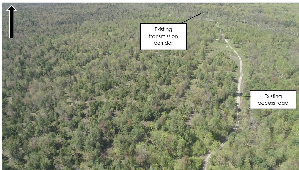
Photo 9: View of existing access road and central portion of the Project footprint.