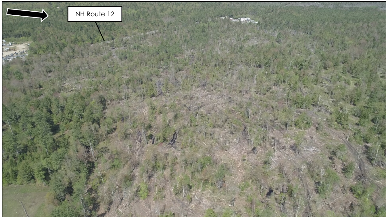
Photo 13: View of extensive harvesting in the southern portion of the Project land control area.